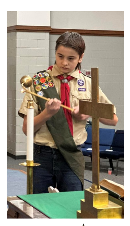
Boy Scout Sunday