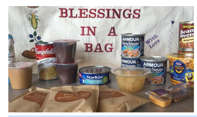
Blessings in a Bag is Changing!

The Youth will be volunteering at several local charities to see how we can help in our own community.