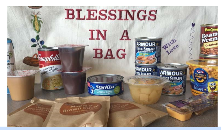
Blessings in a Bag is Changing!

Currently Parkview Church is partnering with Trinity Church and St. James Church to service 4 elementary schools and provide weekly meals for 324 students. The cost for Parkview Church is $1,500.00 a month, which isn't affordable.